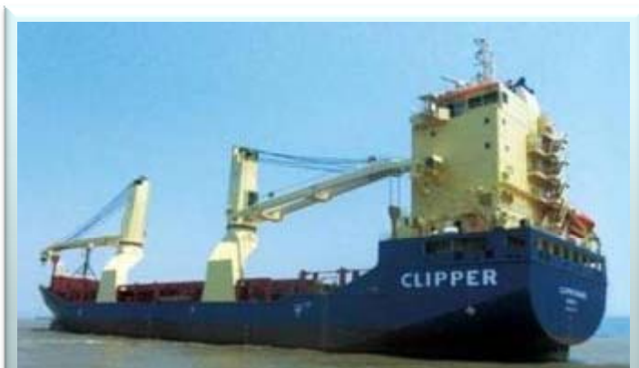
9,500DWT MPV (HEAVY LIFT)

Sailing across the oceans Mooring along every port